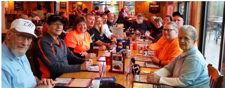
Getting ready to a hearty meal for hearty leaf riders!