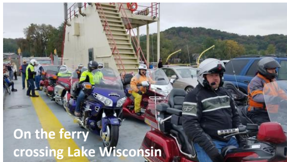
On the ferry crossing Lake Wisconsin