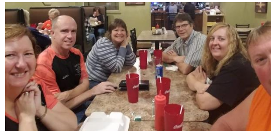
Small but mighty group at the Meet N Eat at Buliceks Landing in Delhi!